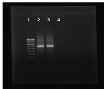
Figure: 1 PCR confirmation of S1 sample using 16S rDNA specific primers

Lane 1- 100 b p marker Lane 2- Positive control Lane 3- S2 sample Lane 4- Negative control