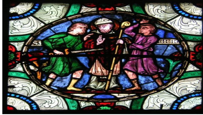
The murder of Archbishop Thomas Becket, at Canterbury Cathedral, is depicted here in a stained-glass window.

Gothic and Romanticism are the two genres which began in 18 th century, many romantic writer have depicted the gothic horror. The gothic writers in Romanticism are the romantic Byronic hero Lord Byron (Augustus Darvell), John Polidori's The Vampyre , Samuel Coleridge's Christabel and The Rime of the Ancient Mariner , John Keat's Isabella or The Pot of Basil . Early Romanticists and Gothic fiction are inspired from the medieval literature, John Macpherson's poems are Gothic in nature and there are Gothic elements in painting. Gothic painting describes the style of natural forms and delicate realism. The greatest Romantic painters Henry Fusseli and Francisco Goya depicted ugliness and starkness, terror and pain and the elements of sublime. The late 18 th century Gothic architecture, stained glass flourished as the expansion of immense window spaces in gothic cathedrals. Red and Blue were the predominant colours.